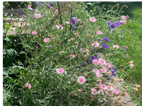
some flowers withstood the storm

We are happy to help walk you through attending online church, using Zoom for virtual gatherings and online studies, and other technical challenges to participating in church online. Send Cari an email ( cari@lcrmarion.org ) or call the church office (319-377-4689) to set up a time.