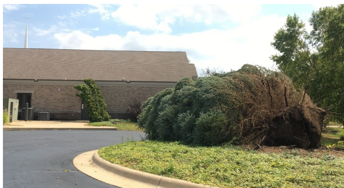
<< patio fence

Find your local number: https://us02web.zoom.us/j/86291568364?