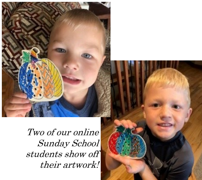
Two of our online Sunday School students show off their artwork!

> At-Home Sunday School activities and coloring sheets are available on the Youth Portal.