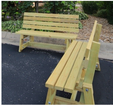
Colin Gillund built us 4 sturdy new patio benches for his Eagle Scout project!