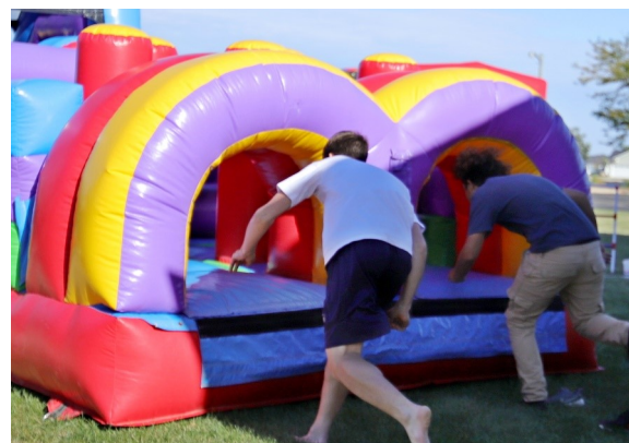
All sorts of outdoor fun at our September event! Even some of the big guys like to go through the Bouncy House.