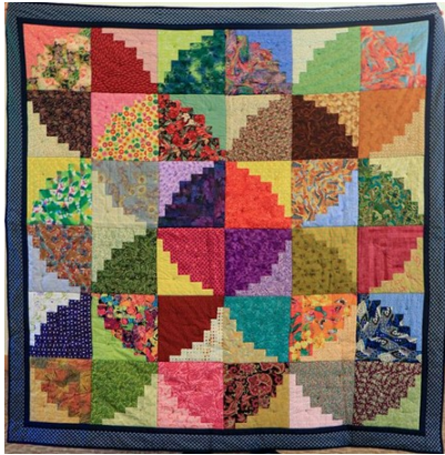
one of our beautiful Comforting Hands quilts!