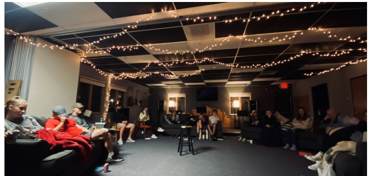
EDGE students: We love being back together again!