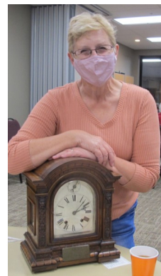
Right: PEP participants share their mementos >