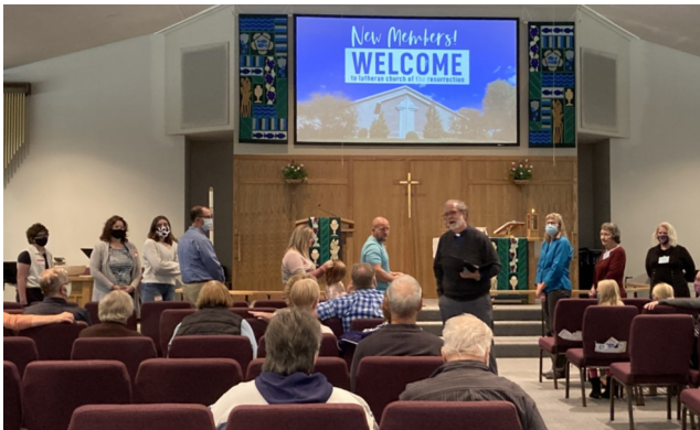
< Left: new members welcomed in worship