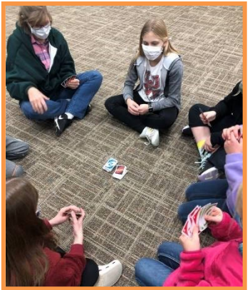
Wednesday Night Live went full Christmas in December. We talked about advent, what light means to us at this time of year and celebrated Jesus as the light of the world!