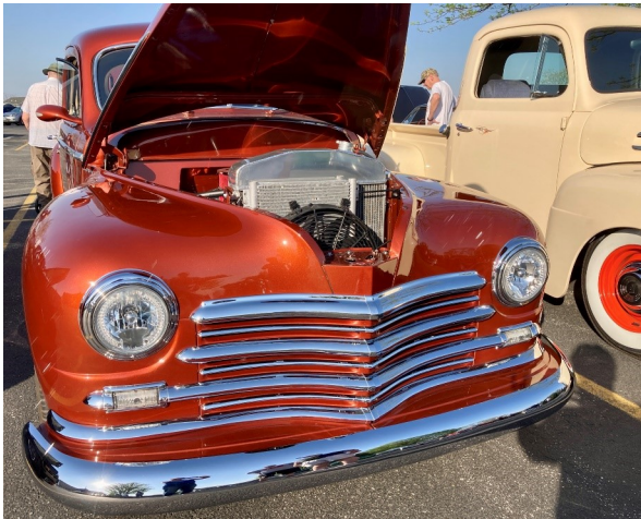
Car Cruise-In is back! Every 2nd Tuesday