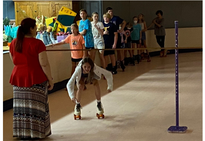
WNL & Confirmation kids take the limbo challenge!