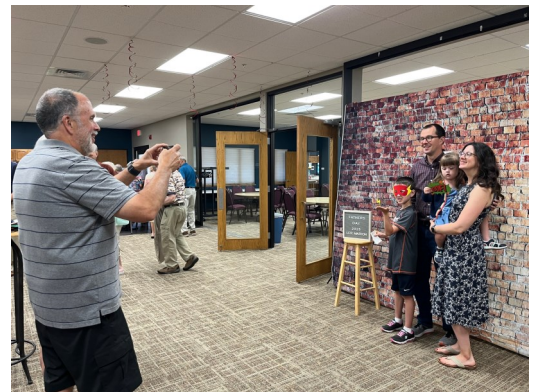
^ Fathers Day 2025 - Make & Take BBQ seasonings and family photo booth

June Sunday in the Park was fun! Make sure to join us on July 20th