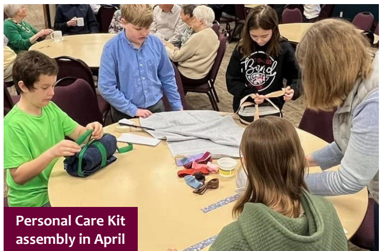
Personal Care Kit assembly in April

Thanks to your incredible support year round - and your quilters and kit-makers - LWR Quilts and Personal Care Kits were pre-positioned in Texas, so within 12 hours of the flash flooding, they were in the hands of those who needed them most. Thank you!